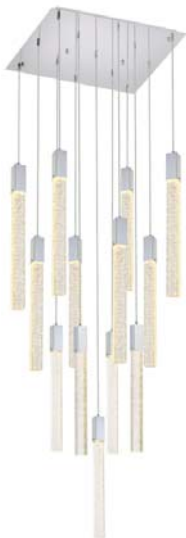
Chrome Item No: 2066G26C