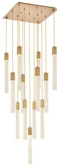
Stain Gold Item No: 2066G26SG